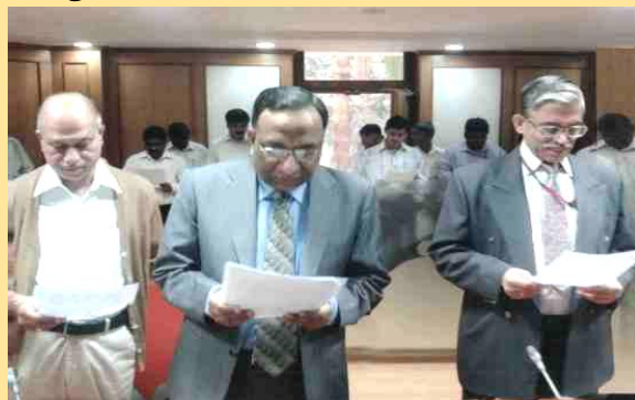
Taking the pledge in the Commission

We, the Public Servants of India, do hereby solemnly pledge that we shall continuously strive to bring about integrity and transparency in all spheres of our activities. We also pledge that we shall work unstintingly for eradication of corruption in all spheres of life. We shall remain vigilant and work towards the growth and reputation of our organisation. Through our collective efforts, we shall bring pride to our organisations and provide value based service to our countrymen. We shall do our duty conscientiously and act without fear or favour.