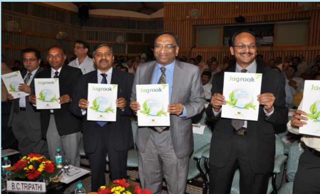
Release of the GAIL Vigilance publication "Jagrook", by CVC.

5. A vote of thanks was proposed by Director (HR), who thanked CVC for taking time out to grace the inaugural ceremony and share his insights with the GAIL family.