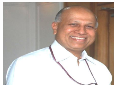
(Pradeep Kumar) Central Vigilance Commissioner