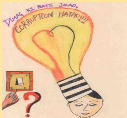
Poster/ Cartoon Competition