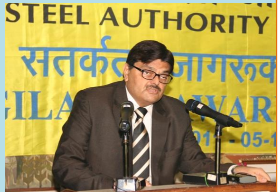
Chairman administering the pledge

7. Talks were also given by CBI officials at various locations. BSP organized a talk on "Moral values for School Children" in association with CBI.