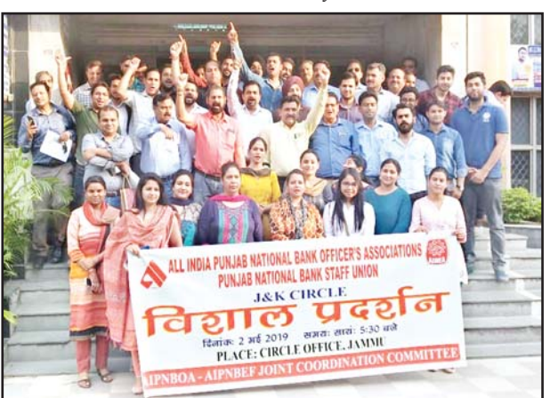
Officers and employees of Punjab National Bank during a protest demonstration at Jammu on Thursday.

A sensitization cum awareness programme was also carried out where ASHAs/Anganwadi Workers/Helpers were educated and trained for challenges and issues being faced by them in the far flung areas where access to proper healthcare remains a far-fetched reality.