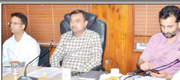
Deputy Commissioner Jammu chairing a meeting on Thursday.

He was conferred with "Rashtriya Gaurav Award" recently in New Delhi by International Friendship Society.