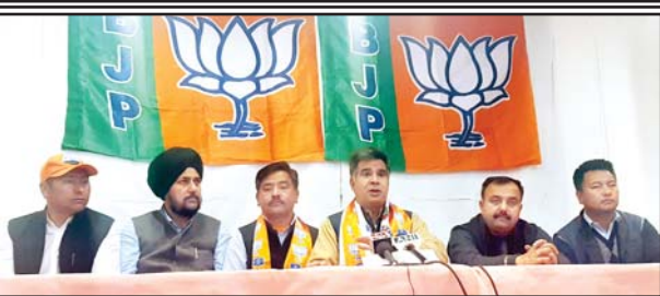
BJP leaders at a press conference at Leh on Thursday.

He added that the Safaikaramcharis including the women are working in worse condition. No safety mask, hand gloves or shoes are given to them. Even the soap for cleaning hands is not given to them. The Council has issued uniform after Union demanded it for three years continuously. The Council is earning huge sum of money from various sources but have nothing for Safaikaramcharis. It is matter of serious concern to deprive them of their rights. He appealed the higher authorities to pay attention towards the grievances of Safaikaramcharis.