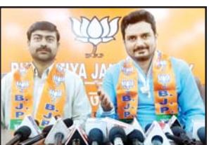
BJP leaders during a press conference at Jammu on Thursday.