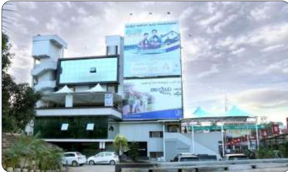
MFC at Hubli