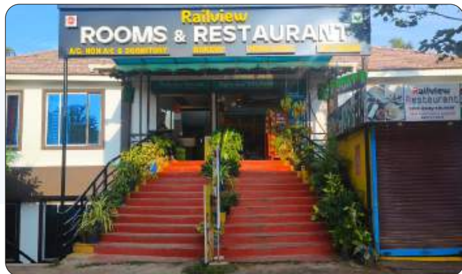
MFC at Alleppey