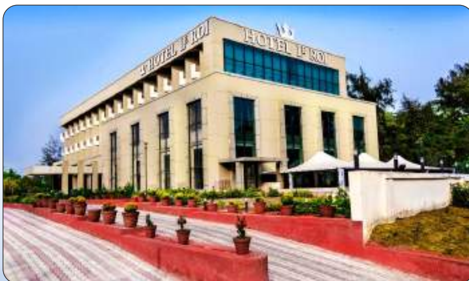
MFC at Digha