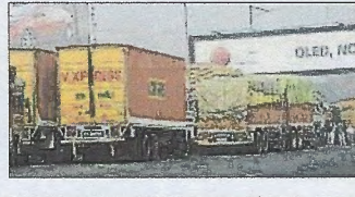
On an average, around 1.5 lakh commercial vehicles are now entering Delhi per day from 13 toll points on the borders

ABHINAV RAJPUT NEW DELHI, AUGUST 25 EVEN AS lockdown conditions are relaxed, there has been a 75% drop in the number of vehicles entering Delhi from 13 toll points at the borders. On an average, around 1.5 lakh commercial vehicles are now entering Delhi per day. This figure used to be roughly 6 lakh in pre-Covid times. A senior South MCD official said the biggest fall—almost 85%—has been in the number of taxis and app-based cab aggregators entering Delhi. The number of commercial vehicles, from tempo travellers to 16-wheeler trucks, have seen a drop of more than 50%, he said.