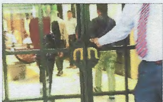
Interpol issues global arrest warrant against Nirav Modi's wife

Further, the release said the "maiden repatriation of $3.25 million is an unprecedented achievement of the government of India, ministry of corporate affairs in its fight against corporate fraud in overseas territory." The ministry also has initiated proceedings for disgorgement of monies from the perpetrators — the entities promoted and/or controlled by fugitive jewellers Nirav Modi and Mehul Chokist.