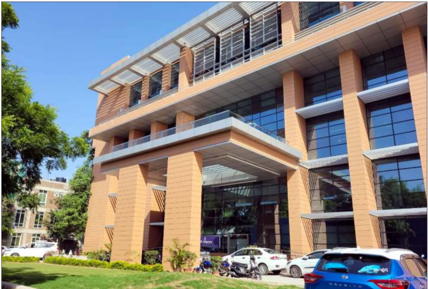
Construction of new State of Art Building of Development of Science & Technology at Technology Bhawan, New Mehrauli Road, New Delhi