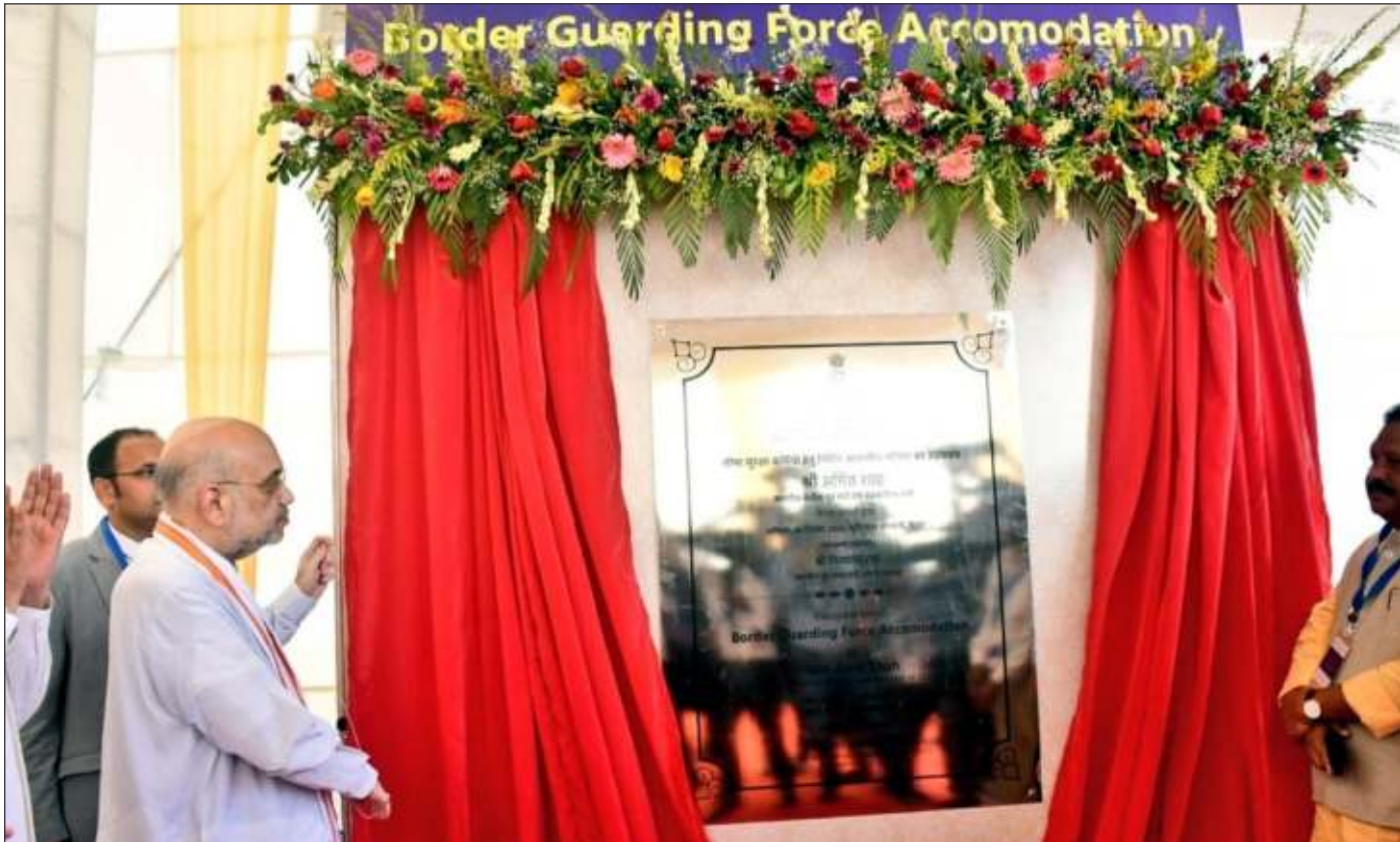
Construction of Barrack accommodation for security personnel at Jogbani