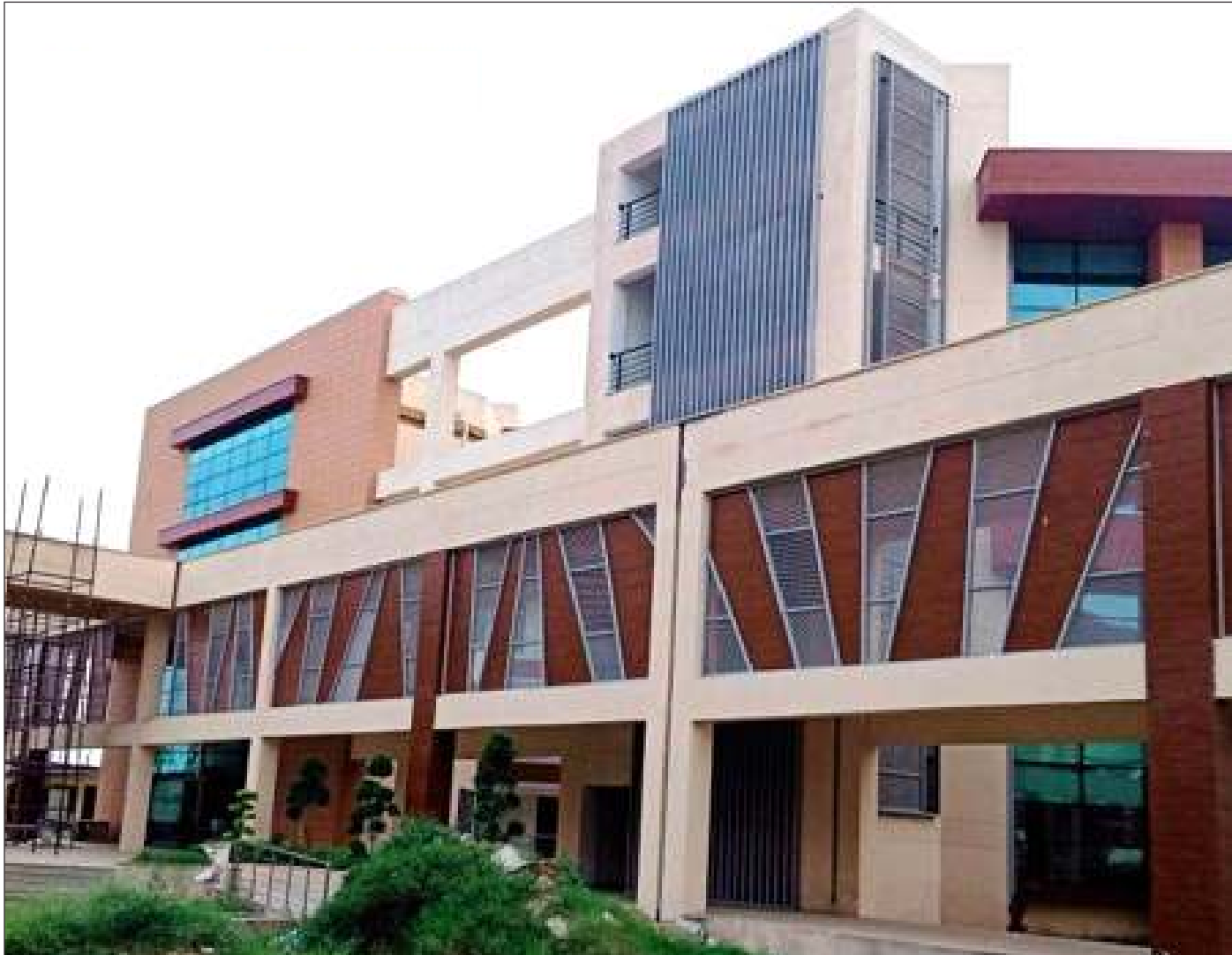
Establishment of Shri Vishwakarma Skill University at Dudhola, Palwal, Haryana