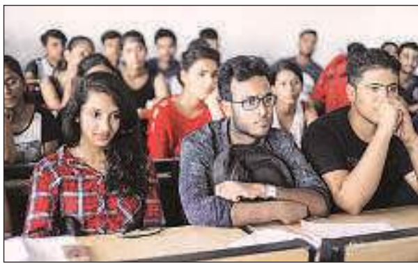
On Saturday, Sisodia said it is unfair to hold exams during the pandemic and withhold students' degrees. Archive

"The MHRD and UGC are not ready to change their decision in the matter. It seems only your intervention can solve this problem. It is my request to you that keeping in mind the overall well-being of students, the government and UGC amend the guidelines, cancel exams for fi-